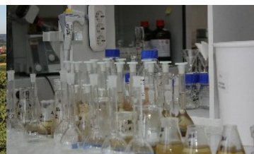
Compost and biochar quality control