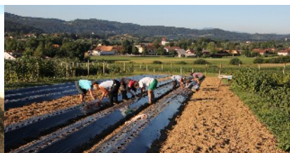
REFERTIL field trial programme