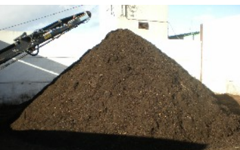
REFERTIL compost product

Disclaimer - The views and opinions expressed are purely those of the writers and may not in any circumstances be regarded as stating an official position of the European Commission.