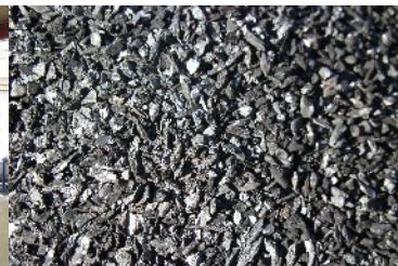
ABC: Animal Bone bioChar product