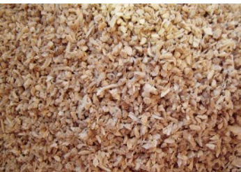
Food grade bone meal input for ABC

REFERTIL has the mission to contribute to the efficient and economical transformation of food industry by-products and farm organic residues from a costly disposal process into an income generating activity.