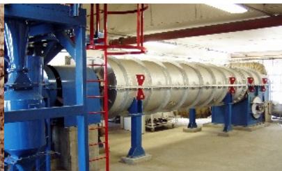
3R zero emission biochar production unit